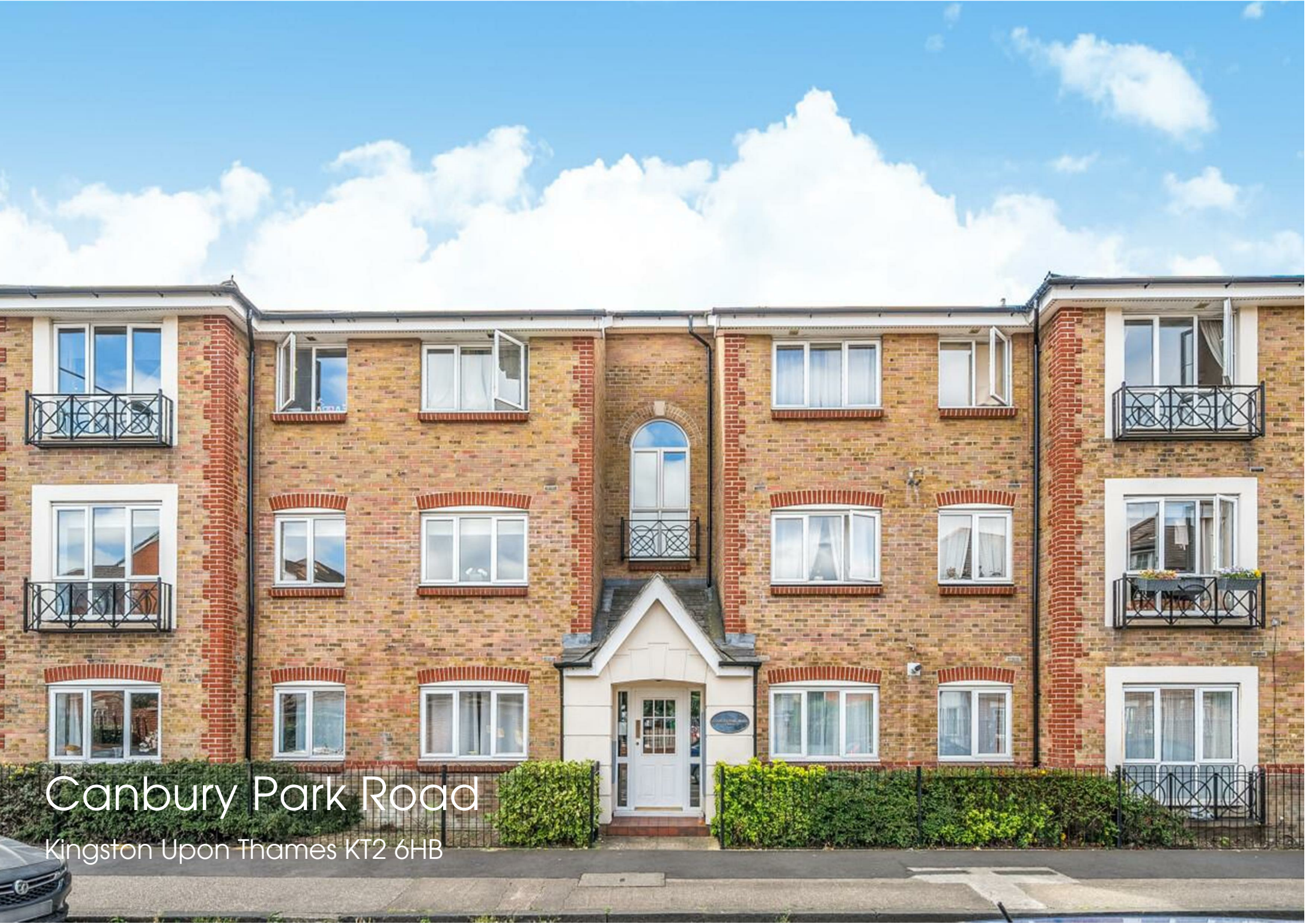
Canbury Park Road Kingston Upon Thames KT2 6HB